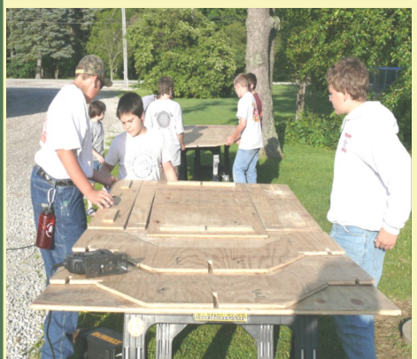
Boys Scouts from Troop 450 spend a June evening making two picnic tables for the North Ridgeville Troop 153.

September 2, 2011 - Birmingham, Ohio – Earlier this spring Boy Scout Troop 153 of North Ridgeville had it's trailer stolen. Many in the greater northeast Ohio region came to their aide offering assistance so these boys could continue to enjoy the many leadership opportunities made available to scouts through outdoor activities. Locally, Boy Scout Troop 450 (Birmingham, OH) set a plan in motion to help as well.